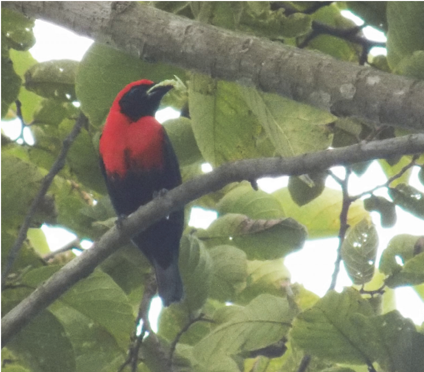
Figure 3. Male Ibadan Malimbe providing insect larvae for nestling, 13 May 2017.

take photographs as we wanted to minimize disturbance. Nevertheless, we observed that the juvenile had dark brown plumage with dull red on the nape, crown and breast, a pale brown mask and bill, and resembled overall the colouration described by Borrow & Demey (2010). Thereafter, we inspected the nest and nest tree in order to know if it would be used for further breeding or roosting. Surprisingly, the nest was already derelict and about to fall off the tree. This suggests that the Ibadan Malimbe uses its nest for breeding only once and abandons it afterward.