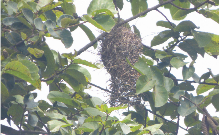
Figure 2. Nest of Ibadan Malimbe, 22 Apr 2017.

Red-headed Malimbe, which placed its nest in the middle of the tree canopy, the nest of the Ibadan Malimbe was positioned towards the tip of the lowest branch, c. 4 m away from the nest of the Red-headed Malimbe.