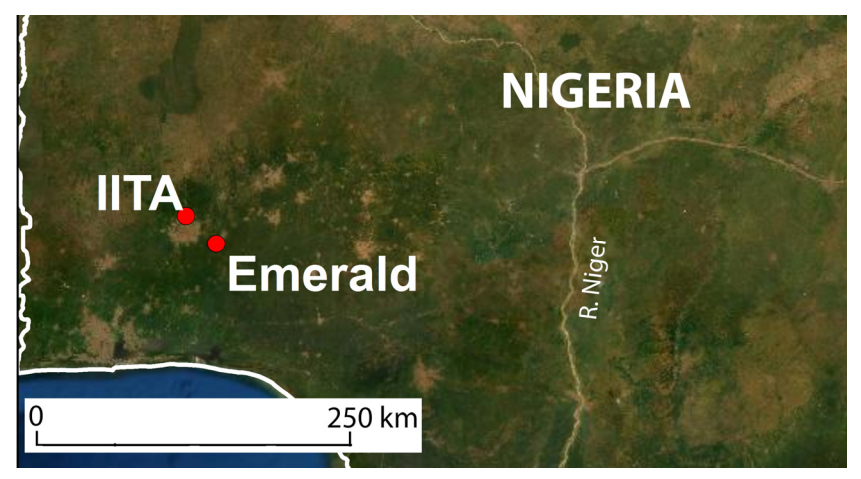
Figure 1. Southwest Nigeria, showing the location of the Forest Reserves where birds were mist-netted (map by IITA GIS Unit).

Due to their proximity, the EFR (7°18'N, 4°8'E; 130 m a.s.l.; 120 ha) and IFR experience a similar climate. The EFR is dissected by two seasonal streams, the Aworin and Akinrin, which flow into the River Osun (Awoyemi et al. 2020), which provides water to communities in the surrounding areas (Olajire & Imeokpartia 2000). The streams and river support luxuriant vegetation forming gallery forest, an important habitat corridor in the area. Antiaris toxicaria, Brachystegia eurycoma, Cynometra megalophylla and Triplochiton scleroxylon are some of the native tree species that dominate the EFR, which supports a high diversity of Guineo-Congolian bird species that qualify the reserve as an IBA (Awoyemi et al. 2020).